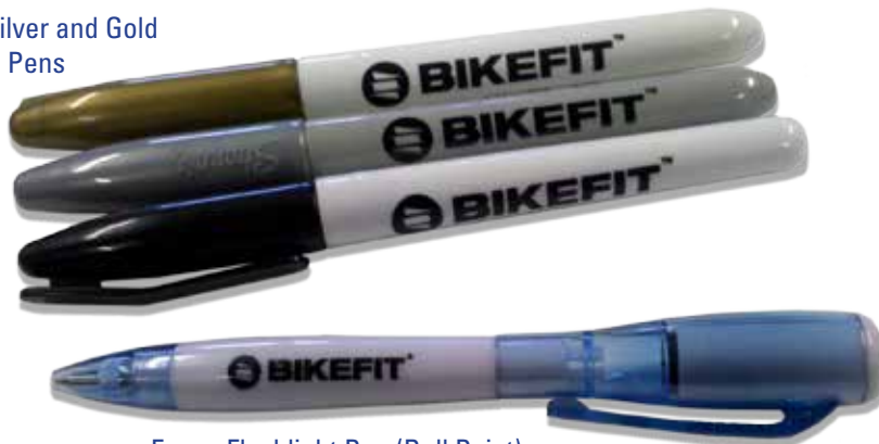
Focus Flashlight Pen (Ball Point)